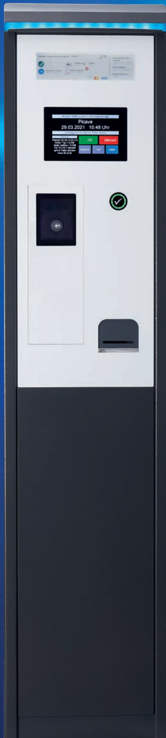
The model shown is a special color. As standard, the PICAVE is delivered in the colors RAL5011 and RAL9006