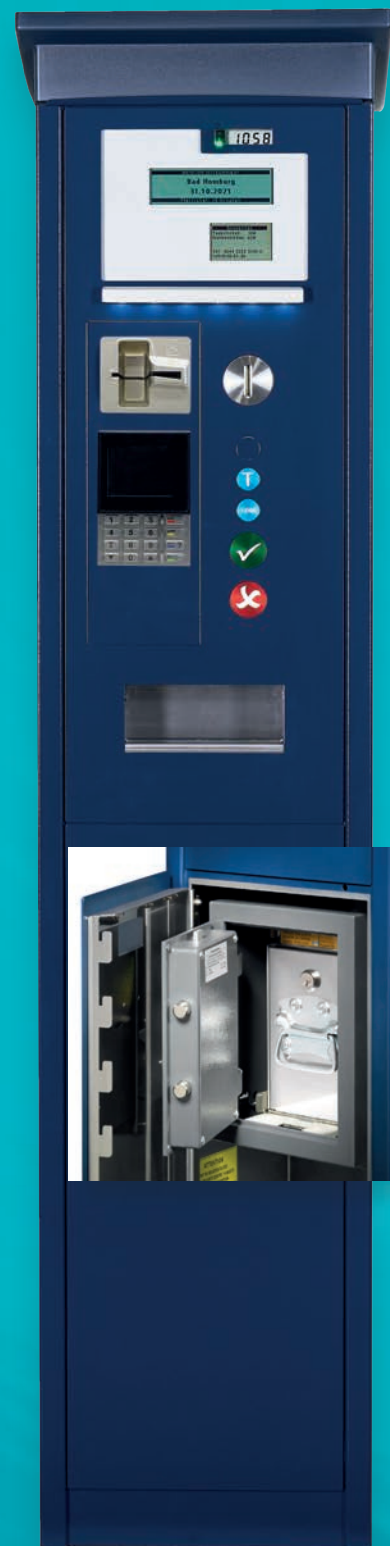
Certified security! Highest classification according to class P4 (VdS directive 3546)

The parking ticket machine can optionally be supplied in the security class P3 or in a version that complies with the VdS Directive 3546/security level P4.